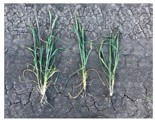
L-R,LRPB Flanker, LRPB Lancer, LRPB Stealth. Tulloona Early Season NVT Trial 2019

LRPB Stealth has been shown to hold 1-2 days longer to head emergence than Lancer in the warmer Northern environments and quicken itself in the cooler southern environments. This indicates a stronger vernalization requirement than its Lancer parent.